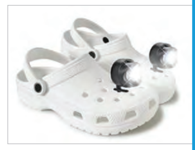
p11 Croc jibbitz with button batteries recalled